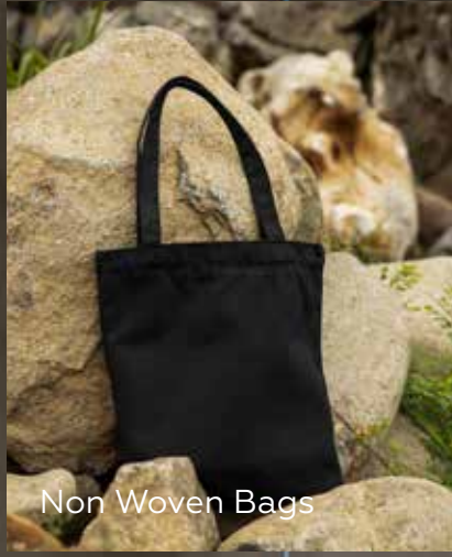
Non Woven Bags