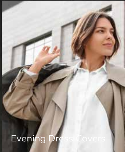
Evening Dress Covers